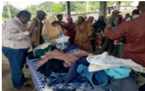
Distribution of clothes to needy people in a village