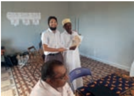
Amir of SIM and President of Al Arkham