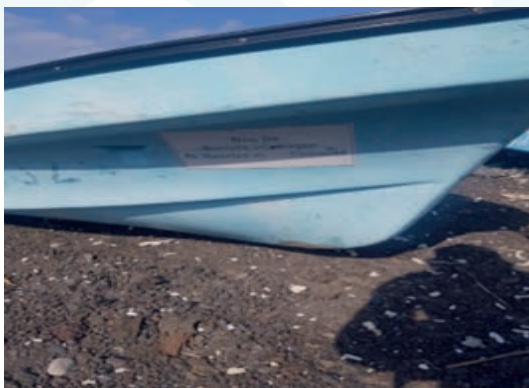
Visiting fishermen in Foumbuni boat sponsored by SIM.