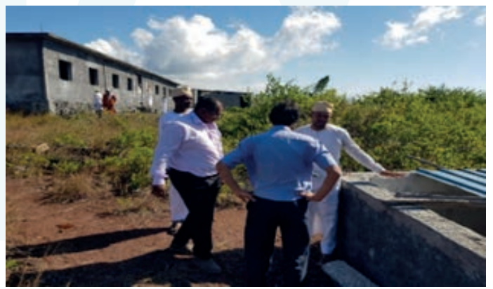
School and water supply under construction.