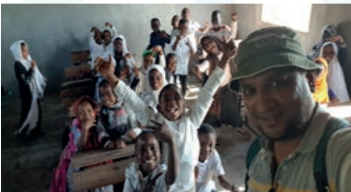
Primary School visit in Dzahadjou {SIM adopted village}