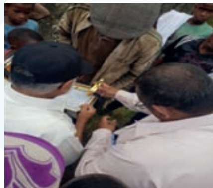
Distribution of Quran pen to villagers