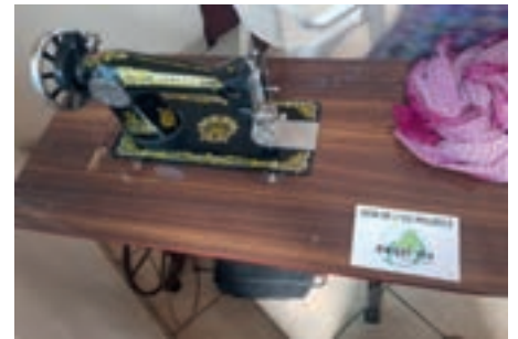
Courtesy visit to a 'cooperative des femmes', who were given sewing machines to empower women of the village so that they can contribute to the family.