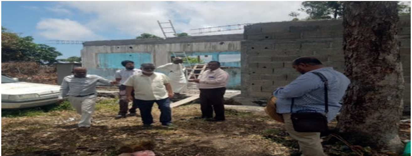
Finalising the 2 nd phase of an operation theatre for women in a private hospital.